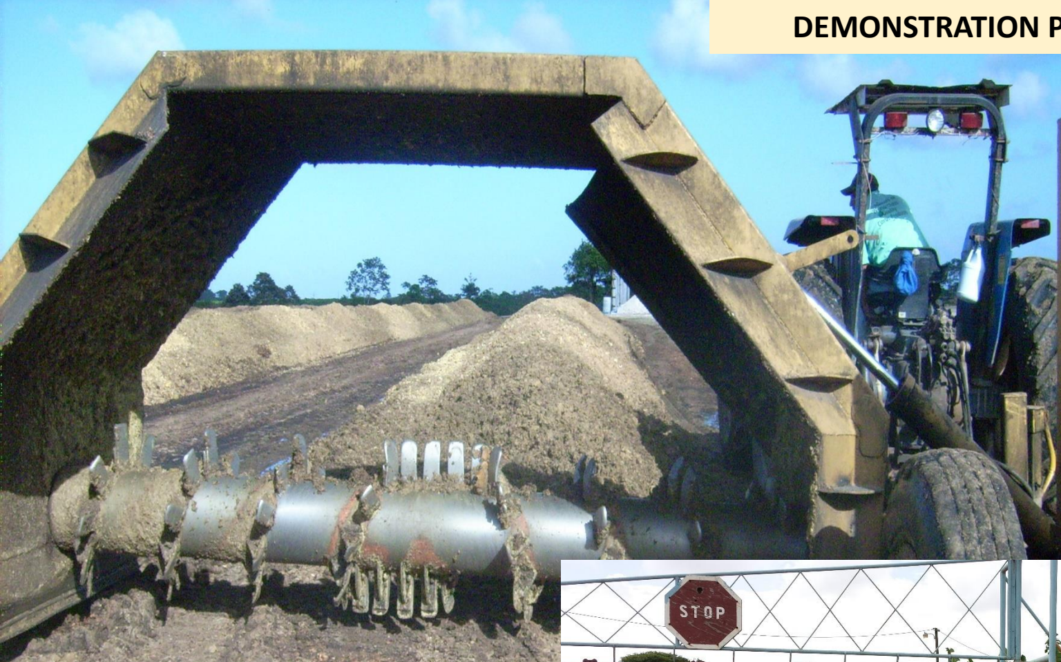
CPBL COMPOSTING PLANT