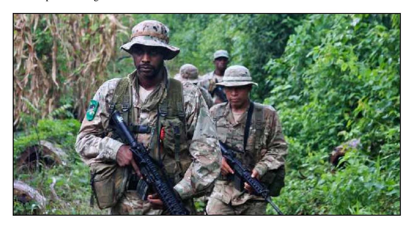
Action 2: Encourage and recognize volunteerism to monitor protected areas

Security forces including Immigration personnel will increase their presence in areas known to be susceptible to illegal incursion.