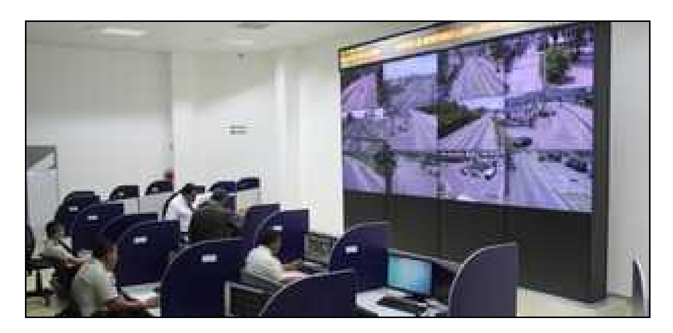
Action 3: Continue to pursue community policing and promote neighborhood watch programs

The Police Department will continue to view the community as a key partner in crime prevention and reduction and pursue the mainstreaming of community policing.