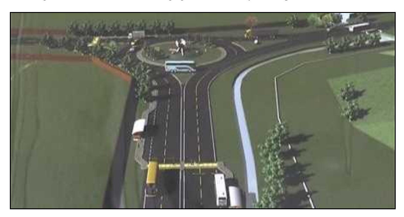
Action 2: Enhance and upgrade the road network based on the recommendations of the NTMP and subject to appropriate feasibility studies

Expenditure will be increased on routine and recurrent road maintenance activity, as well as on undertaking major rehabilitation or upgrade of road networks in order to restore them to good condition and enhance their long-term sustainability. Maintenance of roads deemed critical for accessing tourism sites and for sustaining agricultural activity will be prioritized.