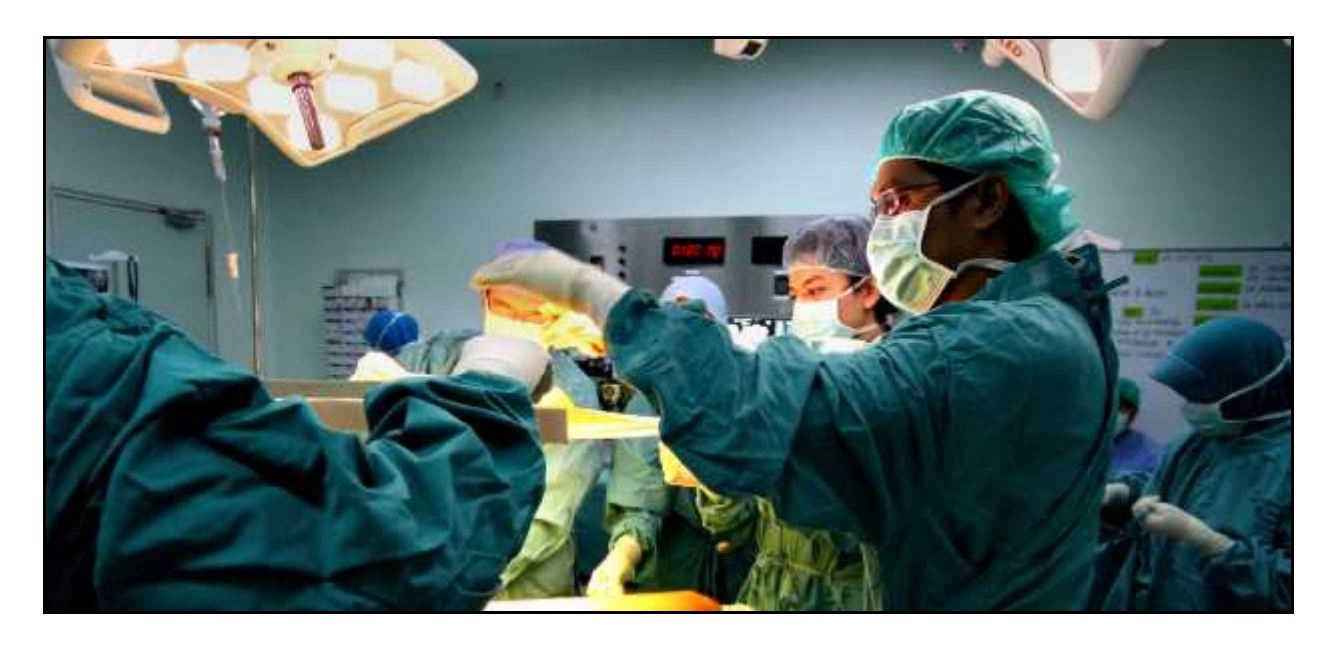
Action 1: Study mechanisms for health care financing

The MOF will collaborate with the Ministry of Health to explore new mechanisms to increase financing of the healthcare sector, including automatic salary deductions, or to use existing financing more effectively and efficiently.